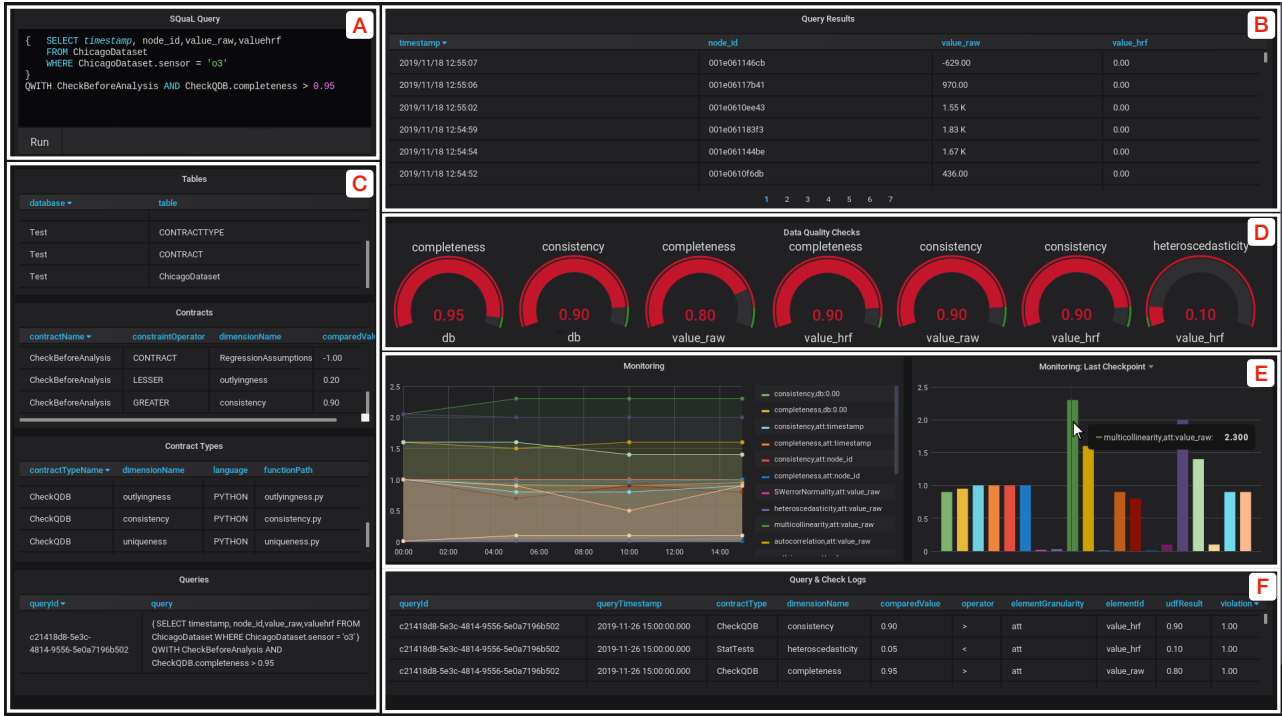
Figure 6: Screenshot of MeSQual’s User Interface with Dynamic Dashboards

• Continuous data-quality checking and monitoring. MeSQual results can help the user in defining or comparing various methods for checking and profiling the quality of data over time, selecting the most appropriate ones, or refining the data quality checking process, and select the most appropriate contracts to monitor continuously;